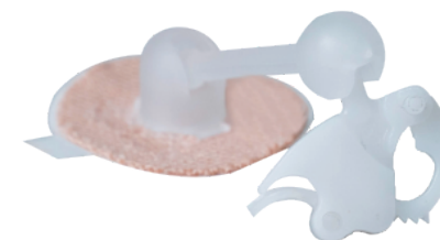
Qiao-Xin (FlexiTape®) 5~ 18FR TUBES