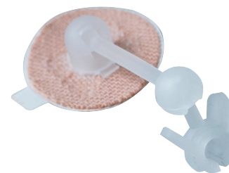
Qiao-Xin (FlexiTape®) 16~ 18FR TUBES