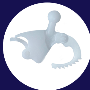
UNIVERSAL CLIP FITS 5~ 18FR TUBES