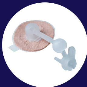
GENERAL CLIP FITS 16~ 18FR TUBES