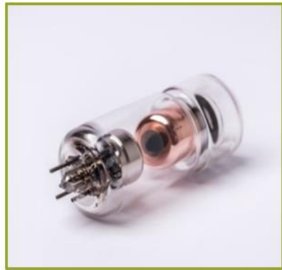
Carbon Nanotube Tube