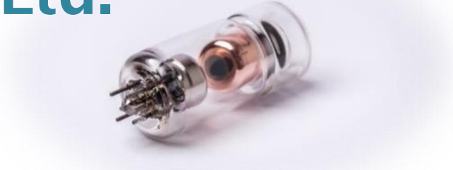
CNT X-ray Tube